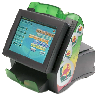
Altura ® Terminal